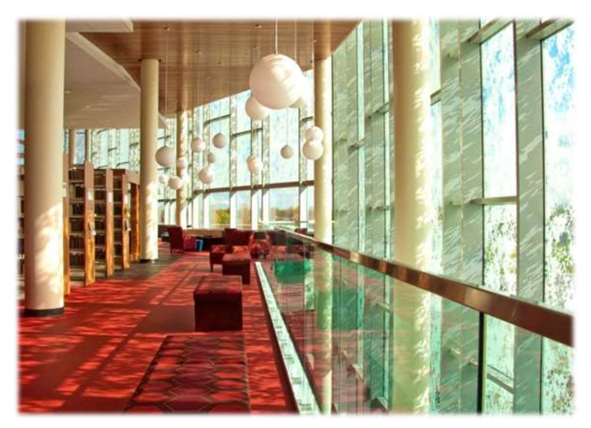
East side of third floor, Fountaindale Public Library